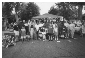
Minneapolis leads the nation for National Night Out Block Parties