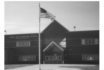
Jenny Lind Elementary School

5025 Bryant Ave N, Minneapolis, MN 55430 (612) 668-2020