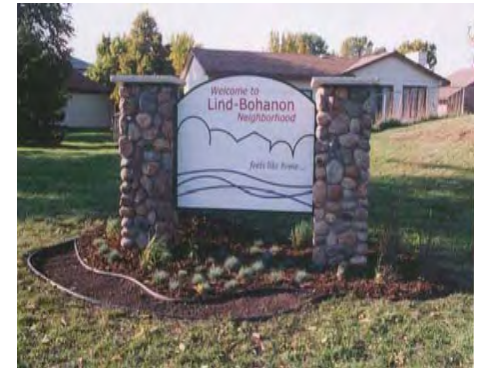
LBNA Lyndale Ave N Gateway Sign 2002

Our community's name comes from combining the school name, Jenny Lind (named for the "Swedish Songbird" who performed for P.T. Barnum's circus for many years), with Bohanon (a family that had much