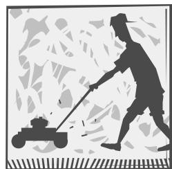
Thanks for being a good neighbor!

There are many ordinances established for urban dweller to help maintain the condition of properties and the community. This is just a sample of some of the main conditions and ordinances the inspectors look for and for residents to be mindful of for your property in the City. Contact 311 or your neighborhood organization if you have questions about possible violations or if you need assistance.