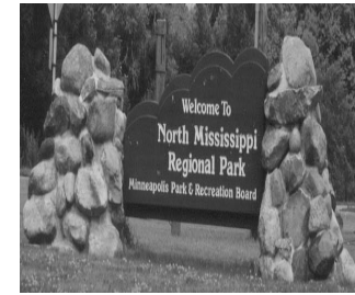
North Mississippi Regional Park

The mighty Mississippi gracefully flows through our neighborhood's backyard. Sitting on it's grand banks are the North Mississippi Regional Park and soon to be Interpretive Center. These have become family gathering places and resources the Lind-Bohanon neighborhood claim as three of it's greatest assets. There are bike paths that mingle and wind throughout our neighborhood and connect to the river, the creeks, and parkways. Families can jump on a six mile loop from the entrance of the