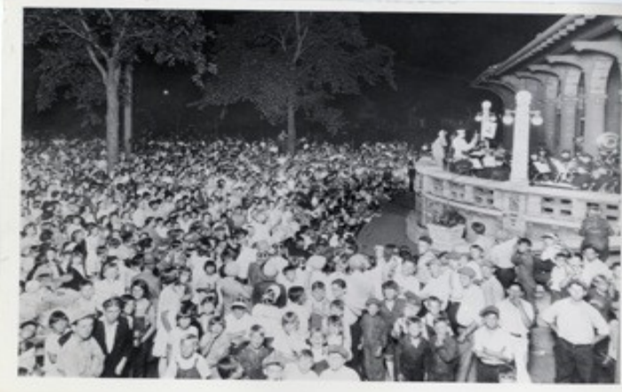
(Singing at Logan Park 1928)