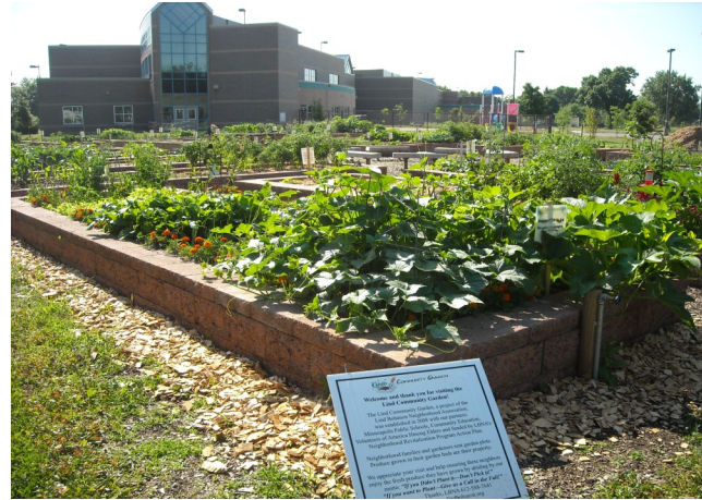
Gardening Matters City-wide Garden Tour Saturday August 6 10am-2pm Start at the Lind Community Garden

Saturday, Sept 17th Riverfest and Heritage Day, 1-5pm at Carl Kroening Interpretive Center