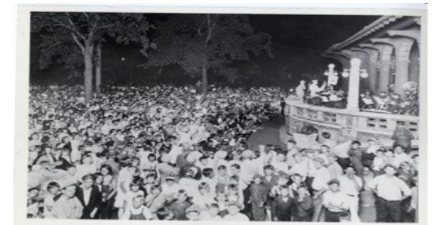
(Singing at Logan Park 1928)

To volunteer or to see photos of last years event check out our website at www.lindbohanon.org .